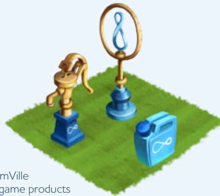
FarmVille in-game products benefited Water.org

Throughout 2012 we partnered with forward-thinking organizations such as Zynga, Levi's, ONE, Bill and Melinda Gates Foundation, AOL, Yahoo! and others. Our collective efforts help tell the water crisis story to even more people, more affordably and more efficiently than ever before.